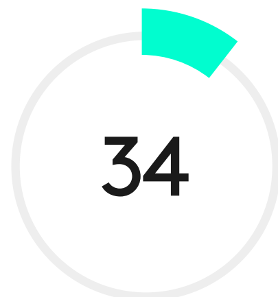
Temporary contract employees